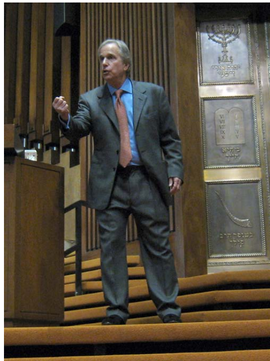
Henry Winkler speaks to a packed house recently at Temple B’nai Jeshurun in Short Hills. His talk was sponsored by the Winston School of Short Hills, which serves students with dyslexia and other language-based learning disabilities.

In Short Hills, a crowd of about 550 packed the sanctuary at Temple B’nai Jeshurun to hear Winkler. Speaking in rapid-fire, clipped tones that often recalled the cadence used by the Fonz,